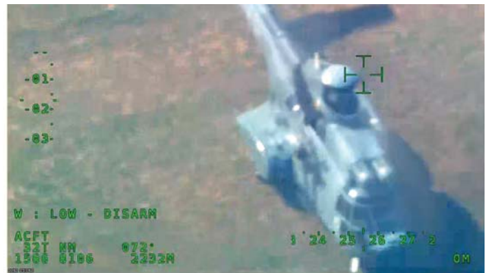
H.265 / HEVC - 1080p @ 1.5Mbps