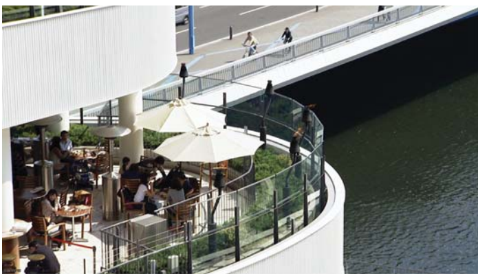
H.264 / AVC - 1080p @ 6Mbps