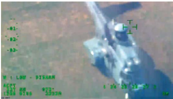
H.264 / AVC - 1080p @ 1.5Mbps