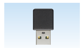
IFU-WLM3 USB Wireless LAN Module