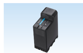
BP-U60T Li-Ion Battery Pack with DC power output