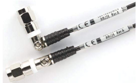
The hinged joint pivots in both directions

NOTE: Disconnect antennas from equipment for storage and transport. 25 lbs. of lateral force near the hinge pin can break the center pin.