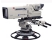
HDC-1000R Multi format HD Studio Camera for Prestige Production