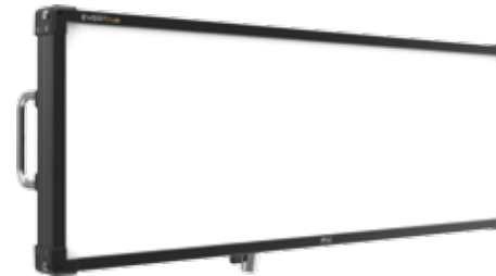
Z1200VC CTD-Soft Vari-Color LED Panel Light