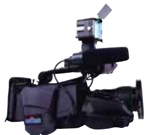
camSuit for JVC GY HM 700