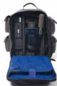
Travel Handy I open