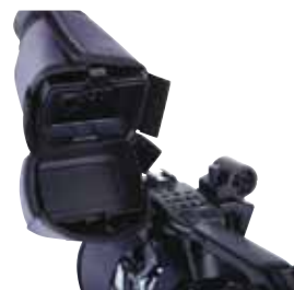
camSuit for Sony EX3