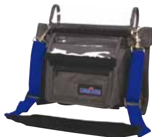
AB SD 1