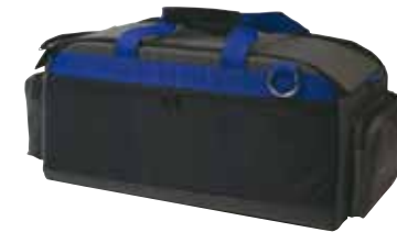
CB Single III back