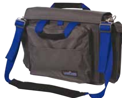
laptopBags carry and protect laptops up to 17"