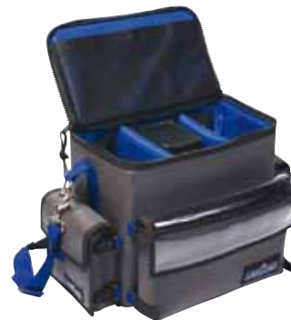
lensCase provides easy access and plenty of space