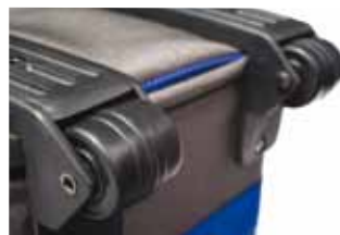
Tripod Bag Roll • detail