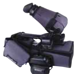
camSuit for Sony EX3