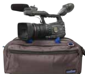
CB Single I with Sony HXR NX 5