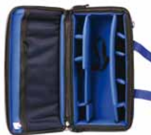
Heavy Duty Small open

The CB HD Large is designed to fit a professional camcorder up to 75 cm / 29.5" and its accessories. This bag is equipped with an outside flat mesh pocket, three adjustable inside pockets and two mesh pockets inside the top closure. Plastic reinforced siding makes the HD Large bag resistant against even the most extreme conditions.