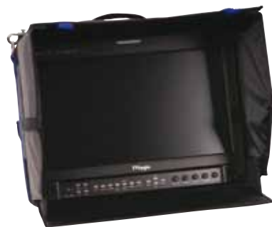
monitorGuard 17" in use