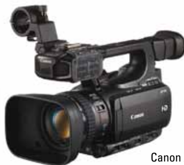
Canon XF100 / XF105