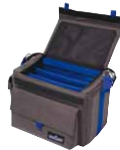
transPorter II open