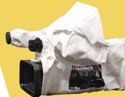
DS EX1 / Z7 / NX5

The desertSuit is the latest feature in camRade camera covers. This suit protects your camera from harsh dust and water conditions found in dry, hot climates and is made with the same noiseless fabric technology as the wetSuit. Because the cover is manufactured in a sturdy white reflecting material, it minimizes and protects your equipment from the heating effect of the sun. Vinyl windows allow you to fully view the controls while your camera is kept safe from the elements.