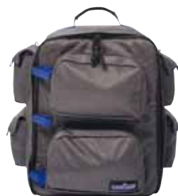
Travel Handy I frontside