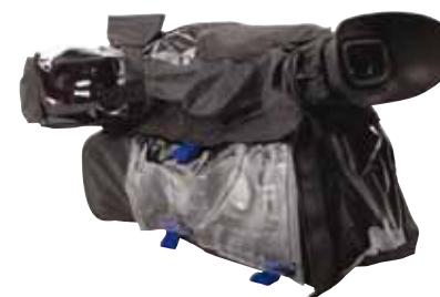
wetSuit for Canon XF305