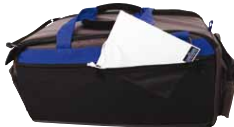
White balance card