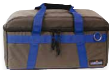
CB Single Small front

The CB Single Small can securely store a professional camcorder up to 42 cm / 16.5" and its accessories in the main inside compartment. This compact yet roomy camBag is also equipped with one external mesh pocket along one side and one external zippered pocket along the other side for holding, for example, your tickets, passport and travel maps.