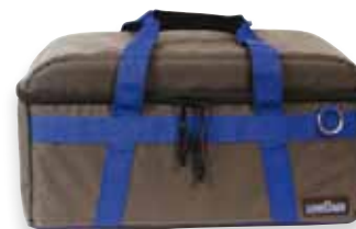
Heavy Duty Small front