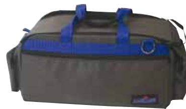
CB Single III front