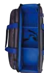
CB Single I open