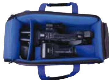
CB Single III open