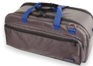
CB Single II