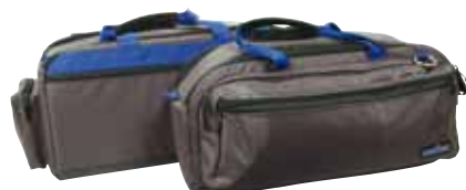
CB Single I sideview

The CB Single I is made to safely hold professional camcorders up to 55 cm / 21.7". This bag is equipped with an outside zippered pocket on one side and a easy-to-reach outside mesh pocket on the other side. These extra pockets are perfect for holding your white balance card, tickets and/or travel maps.