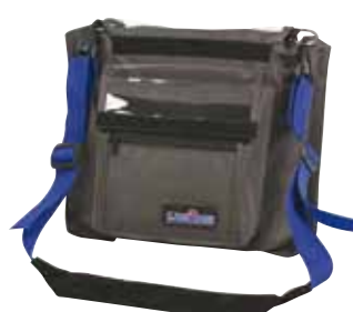
AB SD 2