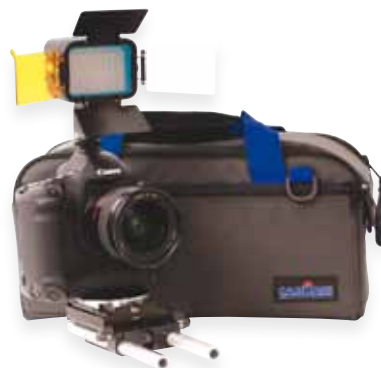
CB Single Small with Canon EOS 1D Mark IV