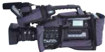
camSuit HVR S270