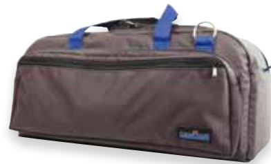
CB Single II

The CB Single II is made to safely hold professional camcorders up to 65 cm / 25.6". This bag is equipped with an outside zippered pocket on one side and a easy-to-reach outside mesh pocket on the other side. These extra pockets are perfect for holding your white balance card, tickets and/or travel maps.