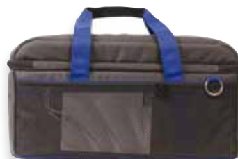
Heavy Duty Small back