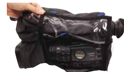
Easy access to your camera controls