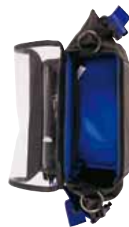
AB SD 2 open