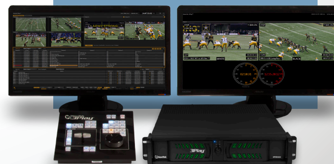
Monitors not included.