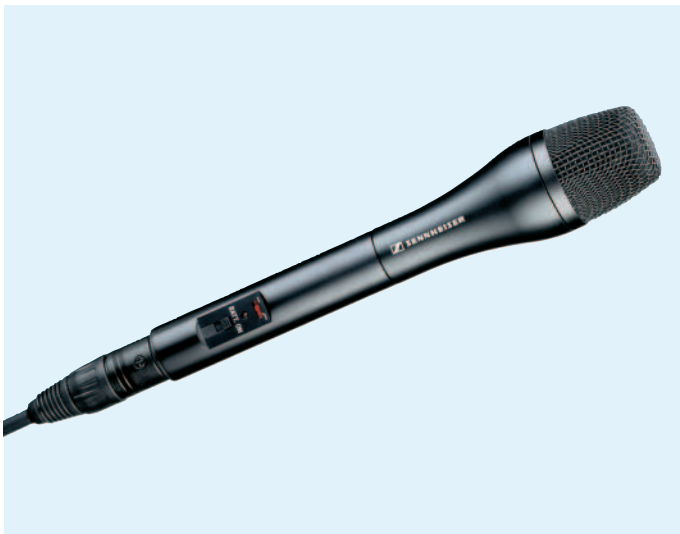
Pictured with K6 powering module and cable (available separately)

The ME 65 is a super-cardioid microphone head designed for use with the K6 and K6P powering modules. It is especially suited to vocal and speech applications. Matt black, anodised, scratch-resistant finish.