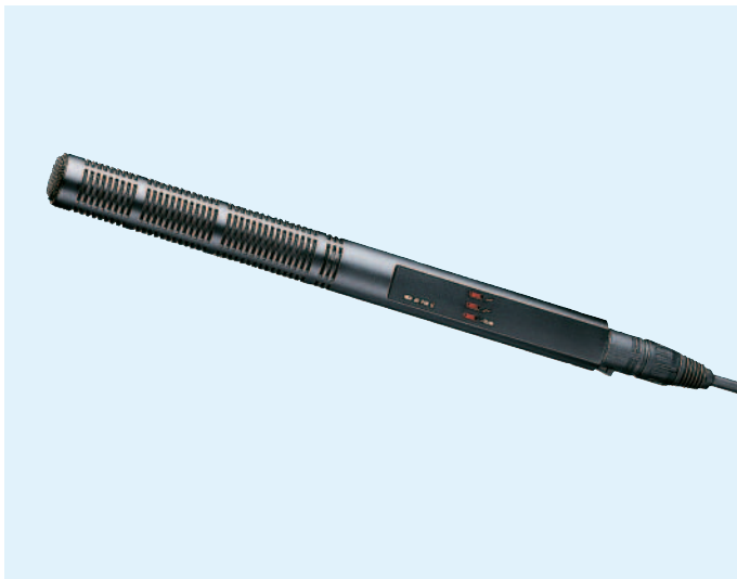
Cable pictured is an accessory not supplied with the microphone

The MKH 60 is a lightweight short gun microphone. It is versatile and easy to handle and its superb lateral sound muting makes it an excellent choice for film and reporting applications. Its high degree of directivity ensures high sound quality for distance applications.