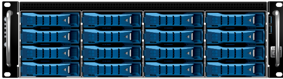
XStream EFS 300 Front