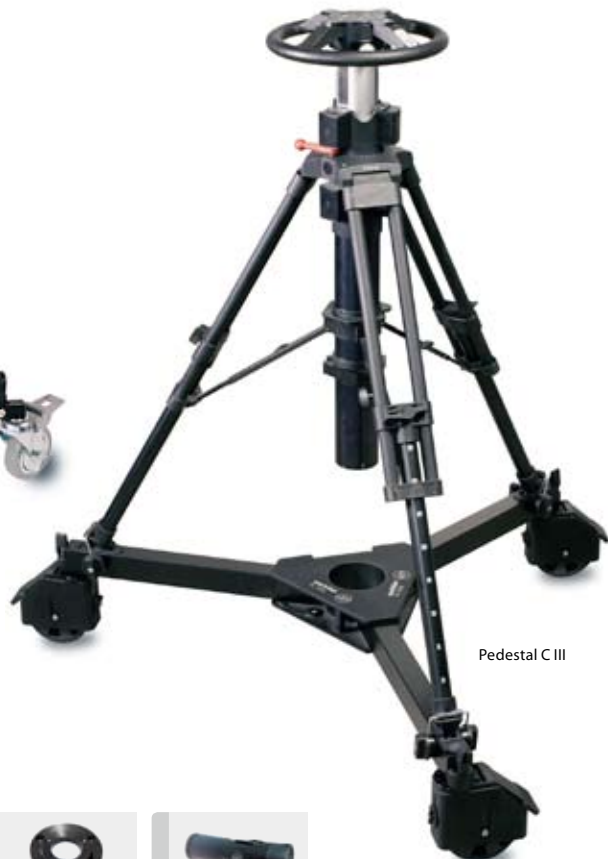
Pedestal C III