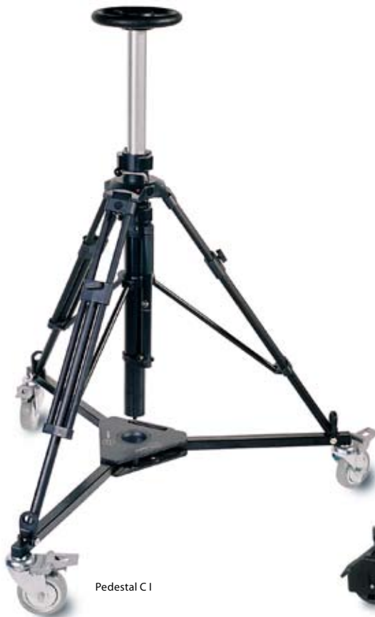
Pedestal C I

The pressure gauge, which controls the air pressure in the Pedestal C III.