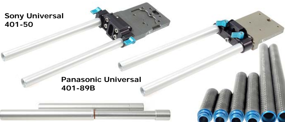
Sony Universal 401-50