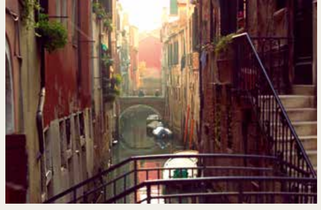
Xenon FF-Prime 50 mm

Schneider-Kreuznach offers a choice of transport solutions for the Xenon FF-Primes. Made of rock solid hard composite material, the Schneider-Kreuznach wheeled hard case features high-density foam cutouts for 4 lenses and rubberized textured handgrips to facilitate handling. Or users may prefer the individual pouches that each holds a single lens. Offering dense foam padded sides and floor, each durable fabric covered pouch zips up to secure contents within, and features a convenient carrying.