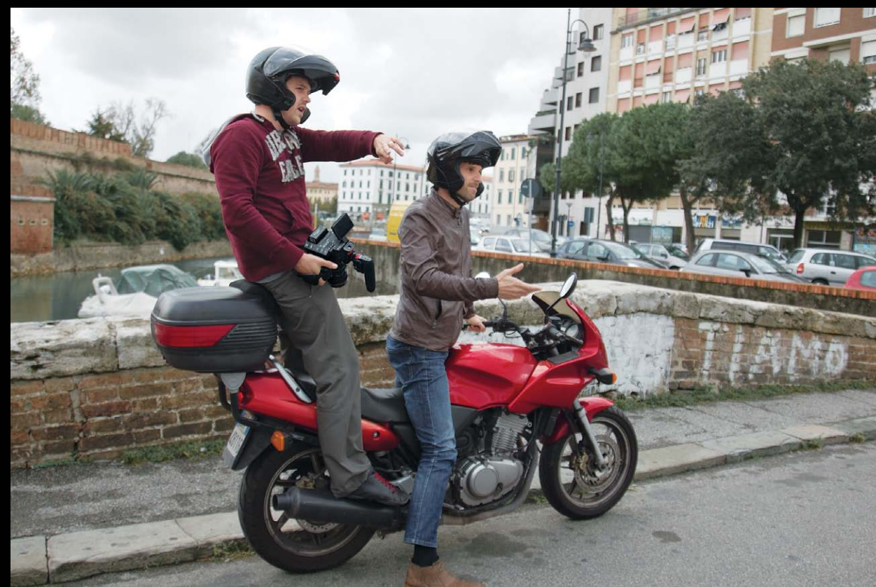
Behind the scenes of the documentary "Pulse."

Many EF Lenses feature Canon Optical Image Stabilizer (OIS) technology, making handheld cinematography more practical than ever before. EF Lenses with OIS are useful in run-and-gun style shoots, low-budgets, or documentaries where an unobtrusive camera configuration may be ideal. Canon OIS technology is built into each IS lens, enabling it to be optimized for the focal lengths and optical characteristics unique to the lens.