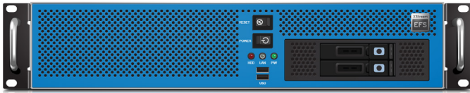
XStream EFS Metadata Server